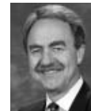
Art Barney 2007, Crystal R 2006