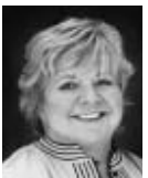
Deanna Carter 2007