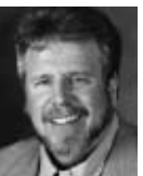
Skip Wing 2006-07