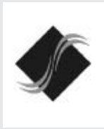
Stringham Real Estate School 2006-07, Sterling R 2002-05