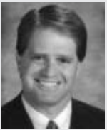
Chris McCandless 2007